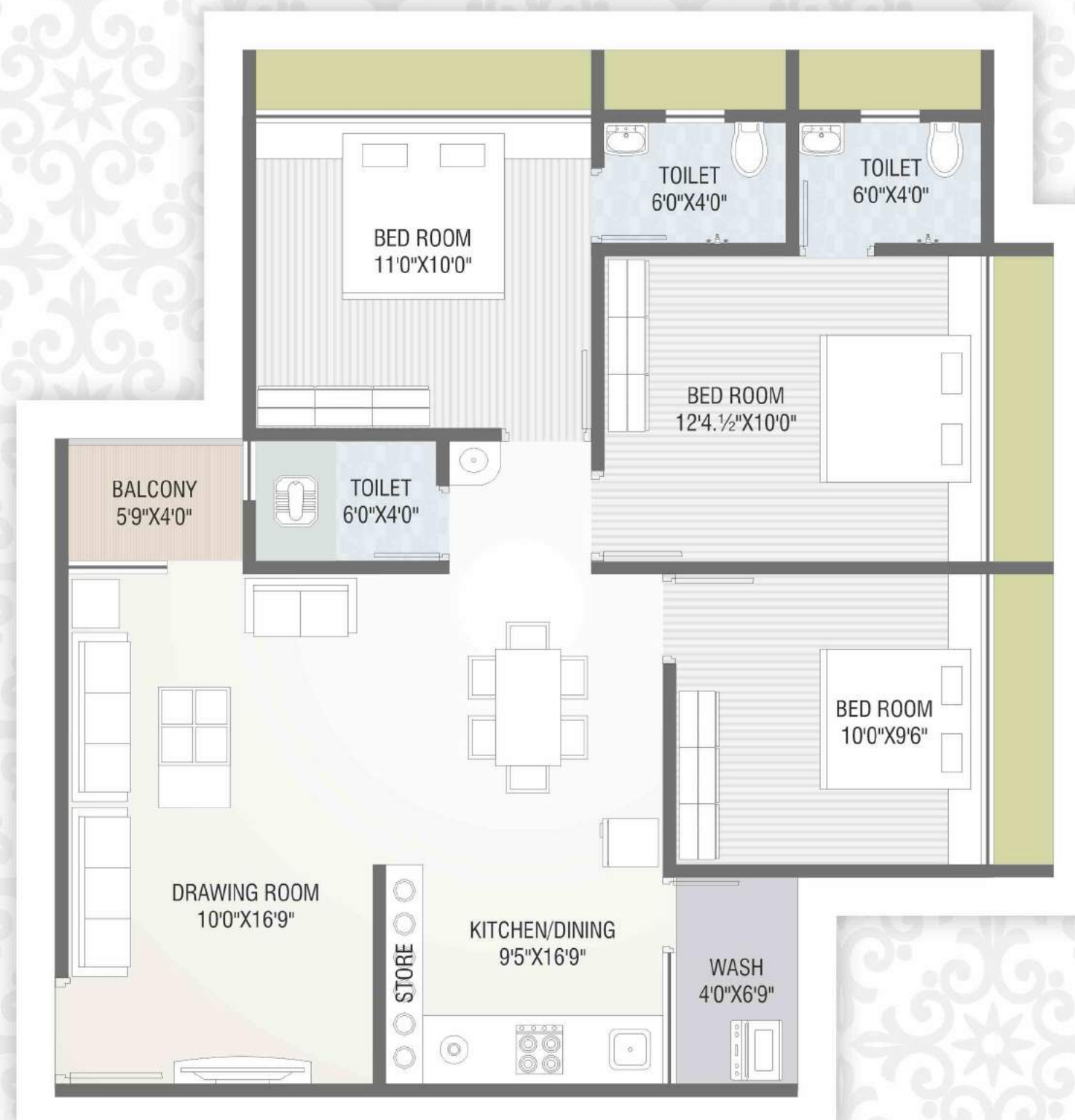
UNIT - 3