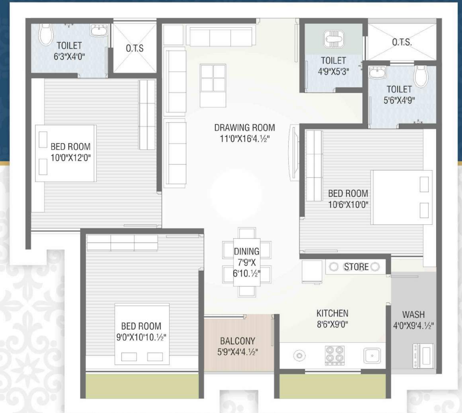
UNIT - 2