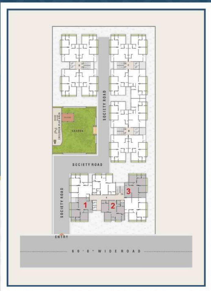
UNIT - 1